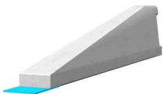
Terminal element REBLOC RB60_3T (inclination 1:5)