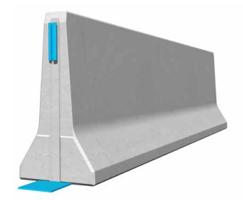
Transition/terminal element REBLOC 140SFS_5.5TS