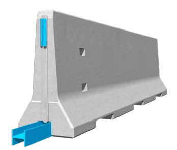
Standard element REBLOC 140SFS_5.5_H4a/W4