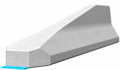
Terminal element REBLOC 80X_4T (inclination 1:5)