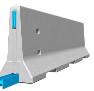
Standard element REBLOC 140SFS_5.5_H4a/W4