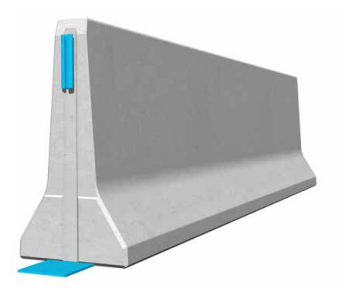
Transition/terminal element REBLOC 140SFS_5.5TS